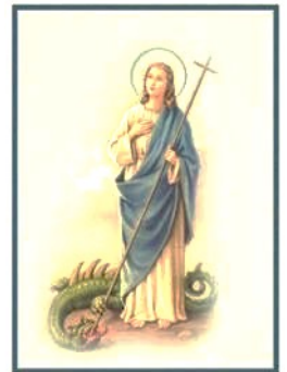
Saint Martha Pray for Us

July 29 th marks the Feast Day of Saints Martha, Mary, and Lazarus. In February 2021, Pope Francis declared a combined Feast Day to celebrate the three siblings. The three are the patron saints of siblings. They are three siblings who were close friends of Jesus. Pope Francis stated that, "In the household of Bethany, the Lord Jesus experienced the family spirit and friendship of Martha, Mary and Lazarus, and for that reason the Gospel of John states that he loved them." St. Martha loved to host Jesus and prepare meals for him, whereas St. Mary loved to listen to his words. Upon the death of Lazarus, Jesus raised him from the dead.